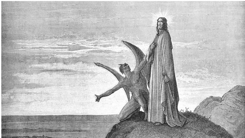
Jesus Tempted by Satan c. 1891 Gustave Doré Bible Illustration